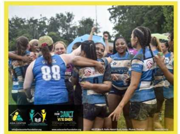
Some pictures of the 2025 event

We invite new teams joining the tournament to “join the club” by considering the sponsorship of a child—continuing a tradition that began after the 2005 tsunami and has since been faithfully carried forward by eight rugby teams. Individual sponsors are also warmly encouraged to connect with us to learn more about how they can get involved. The annual cost to sponsor a child is THB 10,000.